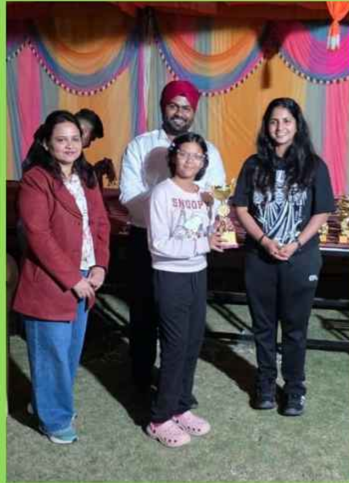
1st (U 11)