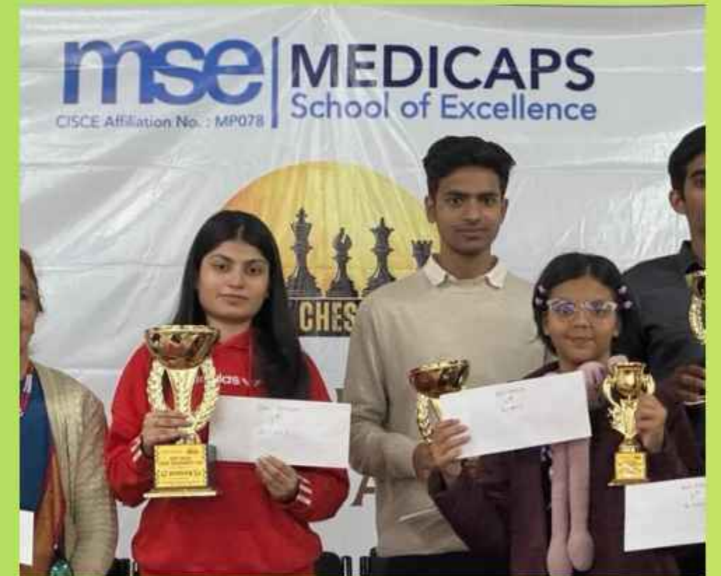
1st Runner Up (Female)