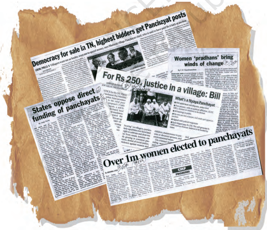
What do these newspaper clippings have to say about efforts of decentralisation in India?

Prime Minister runs the country. Chief Minister runs the state. Logically, then, the chairperson of Zilla Parishad should run the district. Why does the D.M. or Collector administer the district?