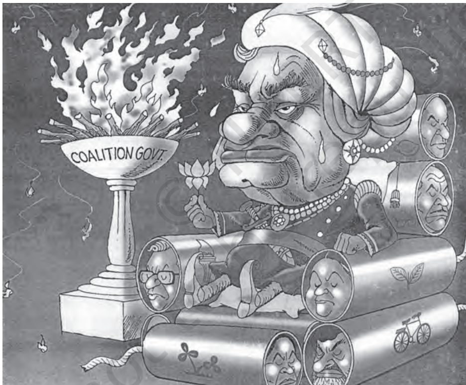
© Ajith Ninan - India Today Book of Cartoons

Here are two cartoons showing the relationship between Centre and States. Should the State go to the Centre with a begging bowl? How can the leader of a coalition keep the partners of government satisfied?