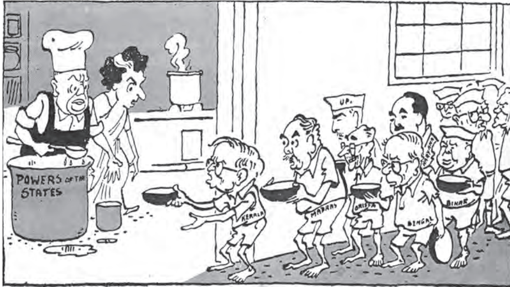
© Kutty - Laughing with Kutty