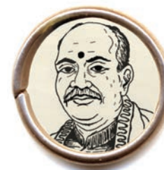
Shyama Prasad Mukherjee

(1891-1956) born: Madhya Pradesh. Chairman of the Drafting Committee. Social revolutionary thinker and agitator against caste divisions and caste based inequalities. Later: Law minister in the first cabinet of post-independence India. Founder of Republican Party of India.