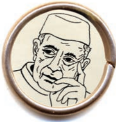
Jawaharlal Nehru (1889-1964) born: Uttar Pradesh. Prime Minister of the interim government. Lawyer and Congress leader. Advocate of socialism, democracy and anti-imperialism. Later: First Prime Minister of India.