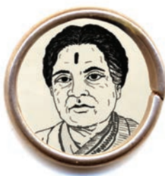
G. Durgabai Deshmukh (1909-1981)

born: Andhra Pradesh. Advocate and public activist for women's emancipation. Founder of Andhra Mahila Sabha. Congress leader. Later: Founder Chairperson of Central Social Welfare Board.