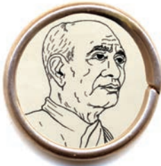
Vallabhbhai Jhaverbhai Patel

(1875-1950) born: Gujarat. Minister of Home, Information and Broadcasting in the Interim Government. Lawyer and leader of Bardoli peasant satyagraha. Played a decisive role in the integration of the Indian princely states. Later: Deputy Prime Minister.