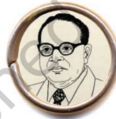
Bhimrao Ramji Ambedkar

(1887-1971) born:Gujarat. Advocate, historian and linguist. Congress leader and Gandhian. Later: Minister in the Union Cabinet. Founder of the Swatantra Party.