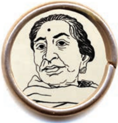
Sarojini Naidu (1879-1949) born: Andhra Pradesh. Poet, writer and political activist. Among the foremost women leaders in the Congress. Later: Governor of Uttar Pradesh.