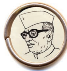
Kanhaiyalal Maniklal Munshi

(1887-1971) born:Gujarat. Advocate, historian and linguist. Congress leader and Gandhian. Later: Minister in the Union Cabinet. Founder of the Swatantra Party.