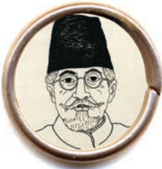
Abul Kalam Azad

(1888-1958) born: Saudi Arabia. Educationist, author and theologian; scholar of Arabic. Congress leader, active in the national movement. Opposed Muslim separatist politics. Later: Education Minister in the first union cabinet.